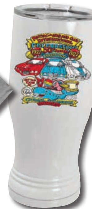
Pilsner Insulated Mug