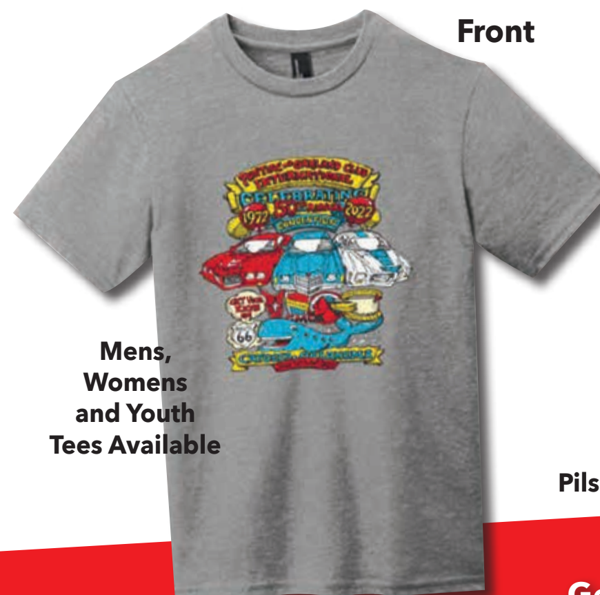
Mens, Womens and Youth Tees Available