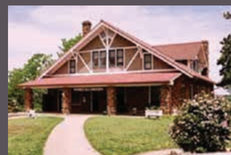
Pawnee Bill's house.

During our visit, we'll tour Lillie's im-